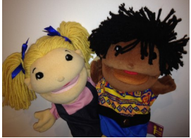
Meet our Rights and Respects mascots Rosie and Raffiqi.

We use objects of reference and pictures alongside our mascots to teach rights.