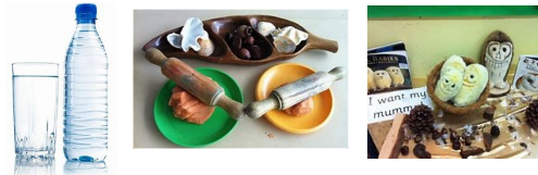
Water Play Education

We use objects of reference and pictures alongside our mascots to teach rights.